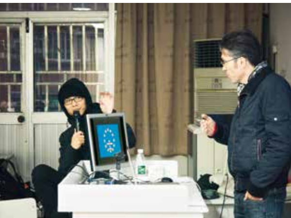
Readymade, lecture by COLLABORATION_ team East China Normal University, Art Department