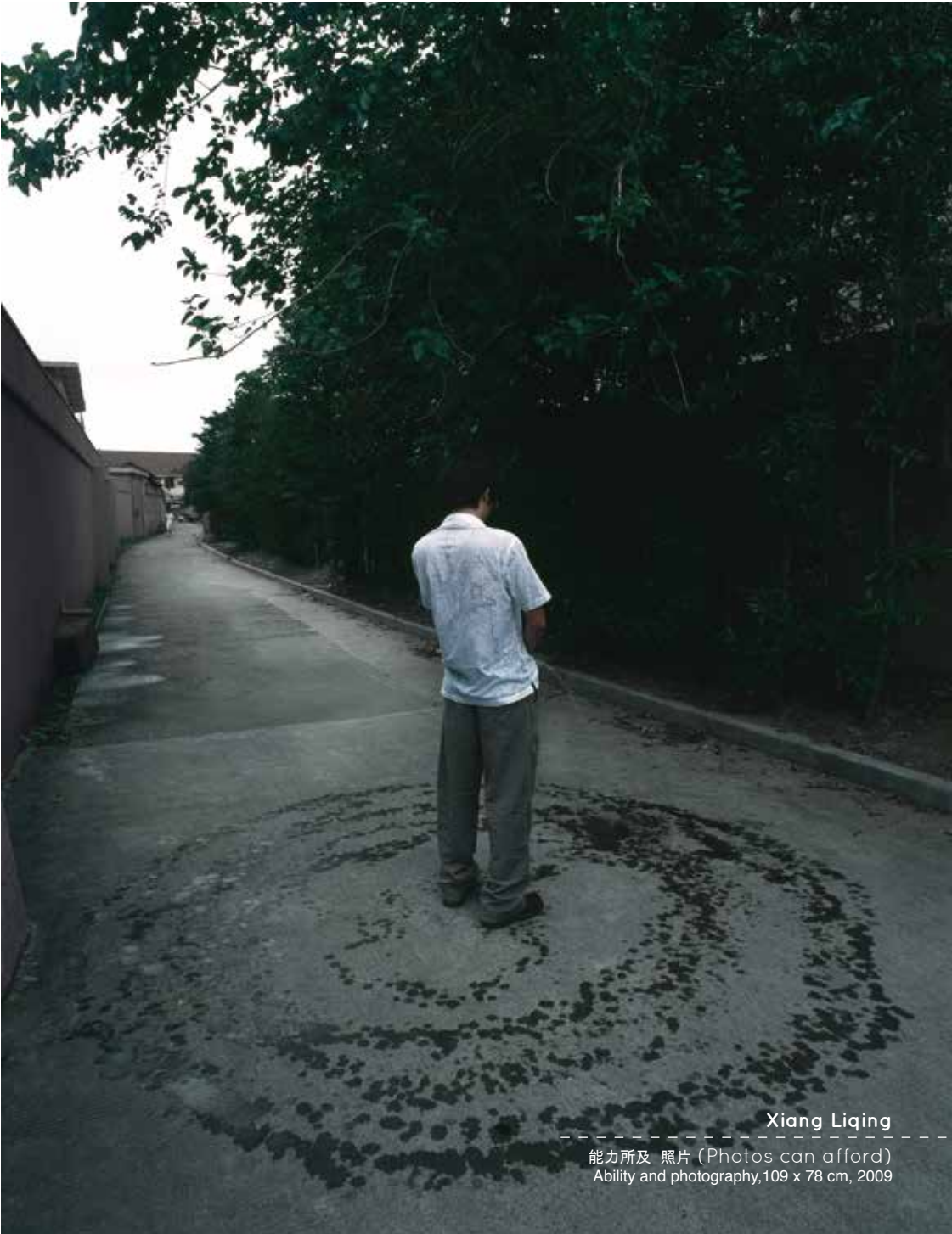
Xiang Liqing 能力所及 照片 (Photos can afford) Ability and photograph, 109 x 78 cm, 2009